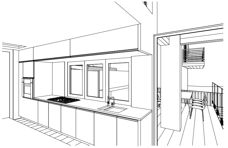
KITCHEN VIEW 1