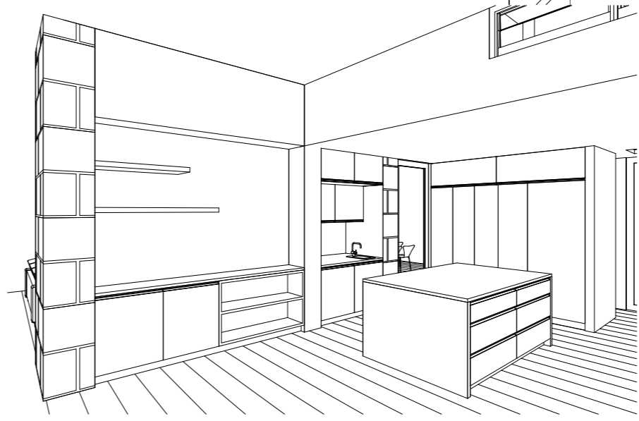
KITCHEN VIEW 2